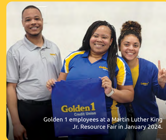
Golden 1 employees at a Martin Luther King Jr. Resource Fair in January 2024.