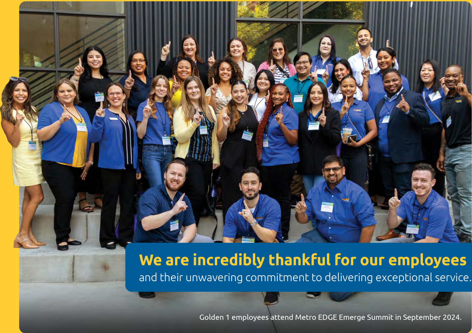
Golden 1 employees attend Metro EDGE Emerge Summit in September 2024.

America’s Best-In-State Credit Unions — Forbes