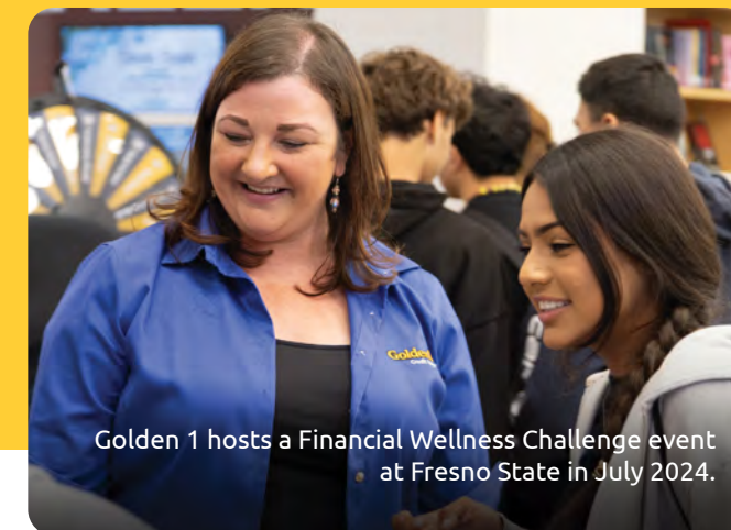
Golden 1 hosts a Financial Wellness Challenge event at Fresno State in July 2024.