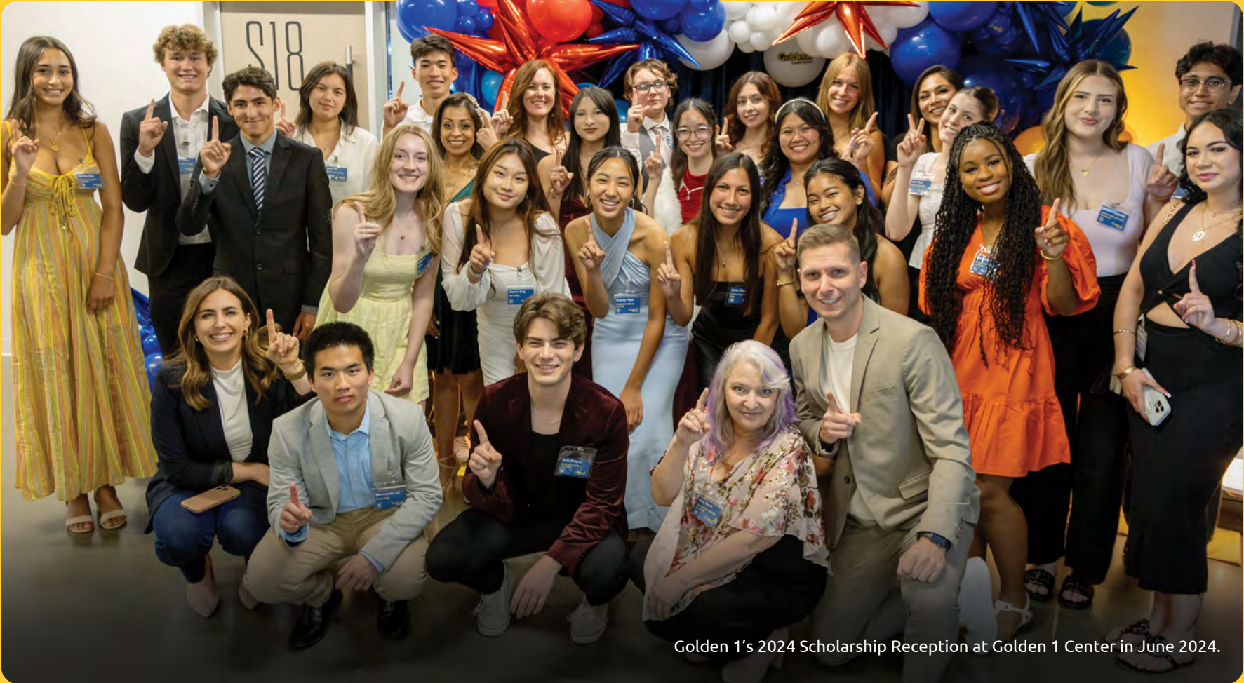
Golden 1's 2024 Scholarship Reception at Golden 1 Center in June 2024.