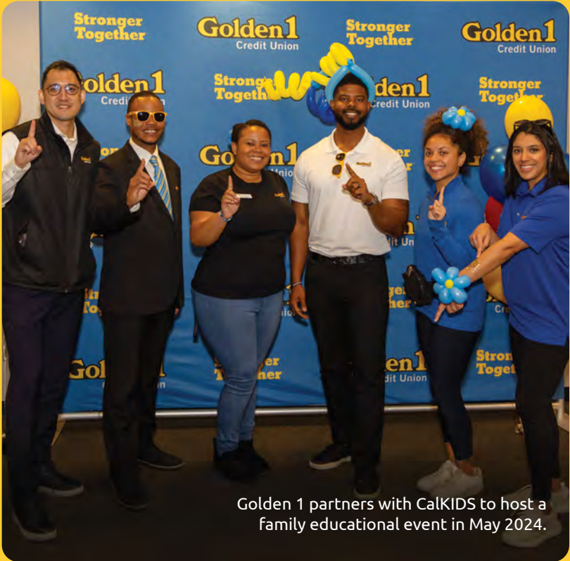
Golden 1 partners with CaKIDS to host a family educational event in May 2024.