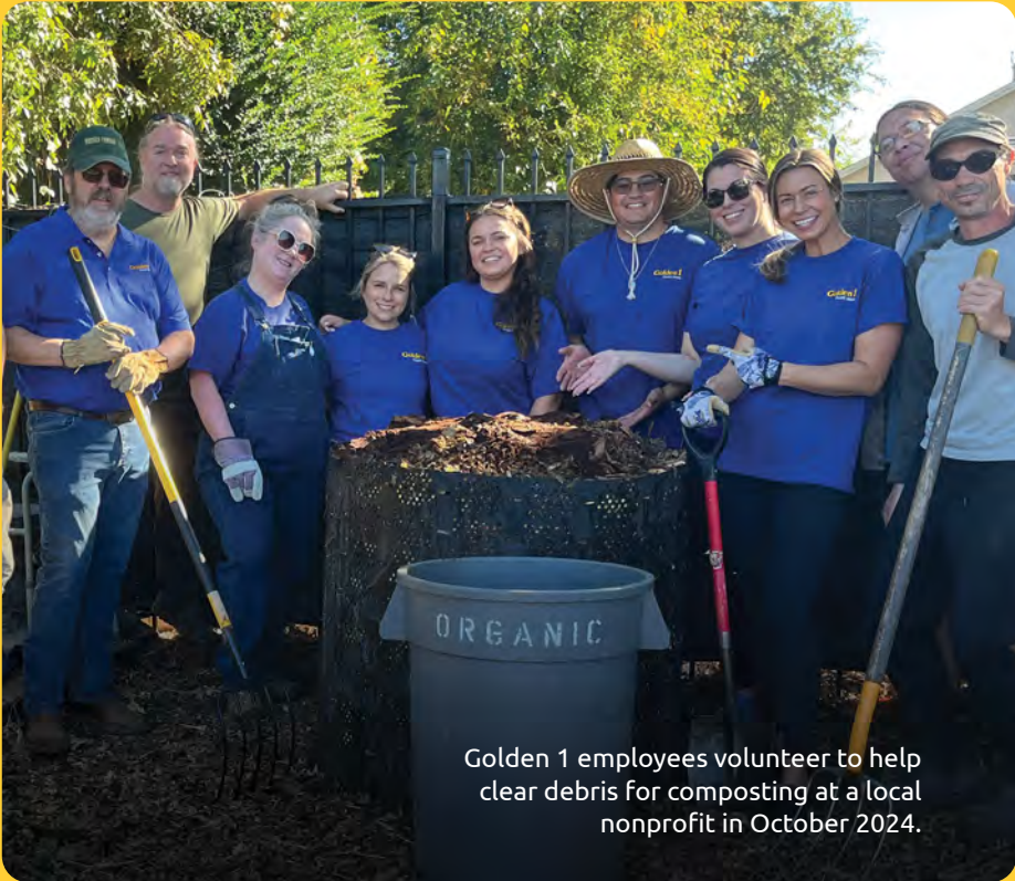
Golden 1 employees volunteer to help clear debris for composting at a local nonprofit in October 2024.