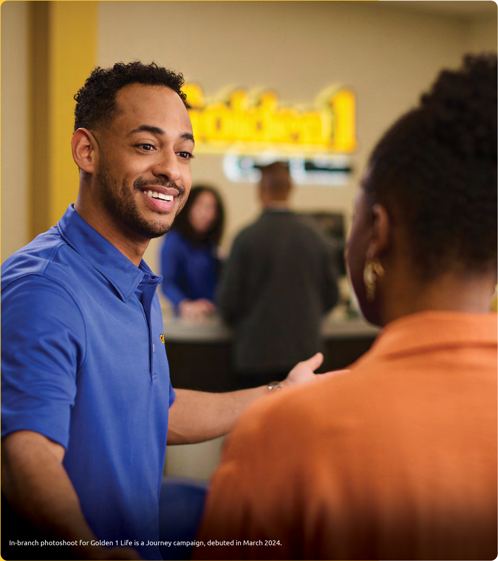
In-branch photoshoot for Golden 1 Life is a Journey campaign, debuted in March 2024.