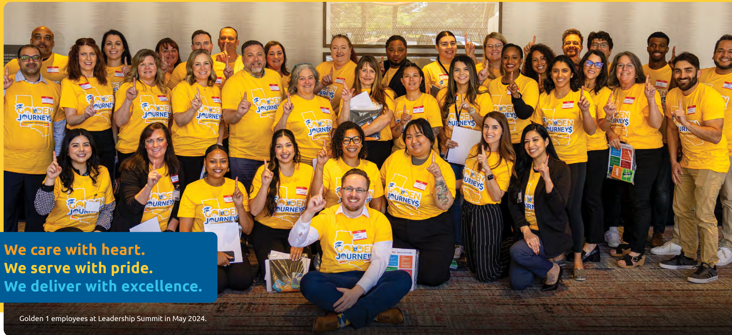
Golden 1 employees at Leadership Summit in May 2024.